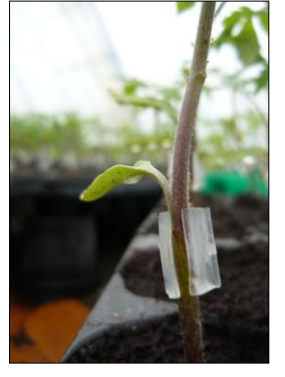
Fig.1 Grafting through the method of: a) splitting; b) copulation at an angle of 45°.

Using the results of the performed researches, the productivity of tomatoes can be analyzed depending on the method of grafting and compared with the control plants (fig.1.).